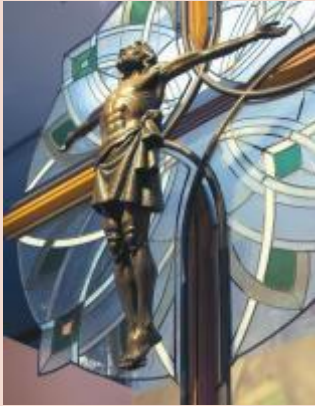
Welcome to Co-Cathedral of St. John the Evangelist

Our parishioners, the parish staff and I, as rector, hope that your visit to our church will be a prayerful time while at the Mayo Clinic or while you are visiting our city for any other reason. We encourage you to consider Co-Cathedral of the St. John the Evangelist as your church away from home. If we may serve you with any of your needs please do not hesitate to contact us at the Parish Center.